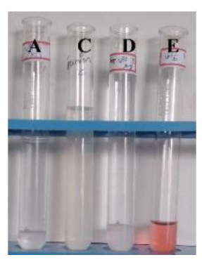
(Vitamin A, Vitamin C, Vitamin D, Vitamin E)