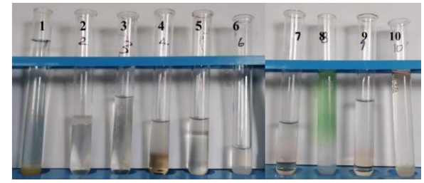
(1.Tannin, 2. Saponin, 3. Flavonoids, 4. Steroids, 5. Terpenoids, 6. Alkaloids, 7. Anthroquinone, 8. Polyphenol, 9. Glycoside and 10. Coumarins) Plate 1: Qualitative analysis of Phytochemicals in Kavuni rice, Soyabean extract

(+) Presence, (++) High concentrations and (-) Absences